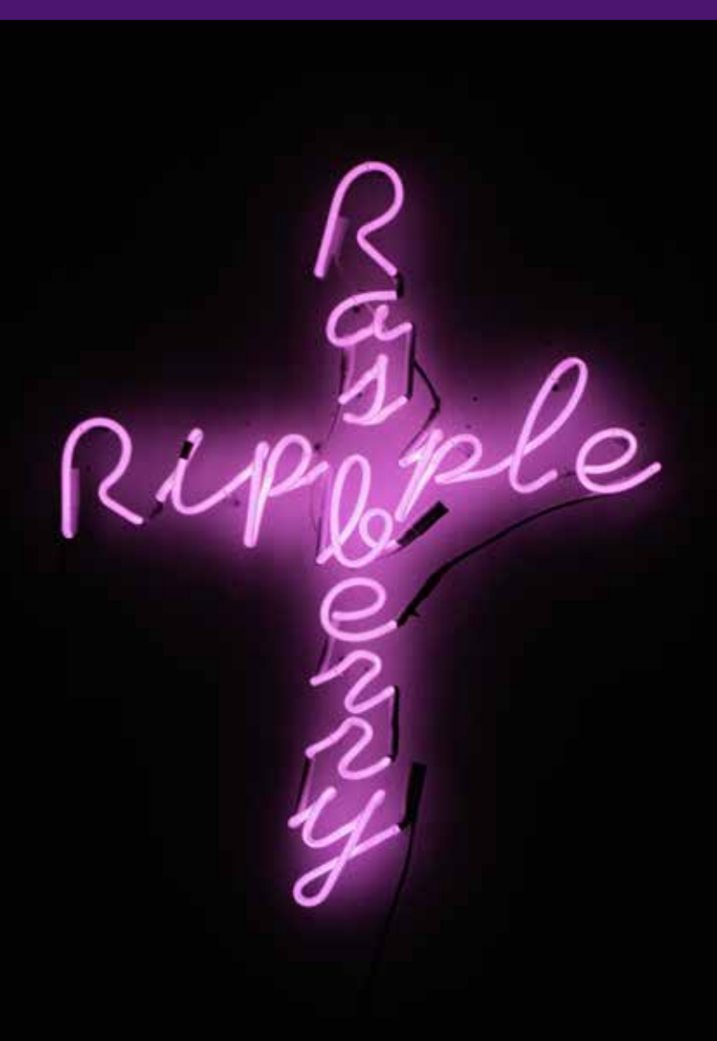
Image: Tony Heaton OBE, Raspberry Ripple, 2018.